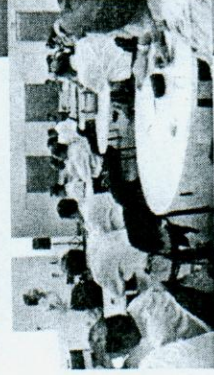
Industry expert addressing a workshop at the Centre