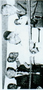
Dr A P J Abdul Kalam, Former President of India inaugurating the Centre on 14 July 2004

CII-Sohrabji Godrej Green Business Centre Survey No 64, Kothaguda Post, NearHITEC City, RR District Hyderabad - 500 084 T: +91-40-4418 5111 E: +91-40-2311 2837 E: s.raghupathy@cii.in W: www.greenbusinesscentre.com www.igbc.in