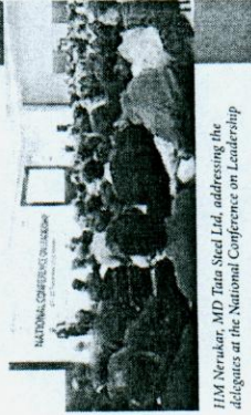
Industry expert addressing a workshop at the Centre

DC-36, Sector - 1, Salt Lake City (Behind City Centre) Kolkata - 700064 T: 91-33-6614 0100 F: 91-33-6614 0136 E: cii-leadership@cii.in W: www.cii-leadership.in