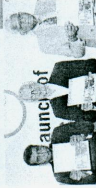
Launch of LEED 2011 for India - Core & Shell Green Building Rating System at Green Building Congress 2011