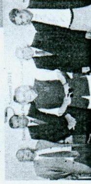
Launch of Greenco Rating System for Companies on 10 February 2011 at New Delhi