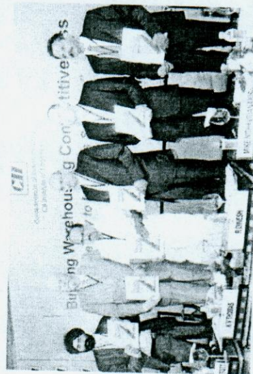
Building Warehousing Competitiveness Summit at Chennai, 2011