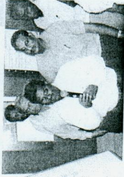
Training session in progress