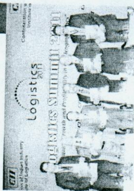
Logistics Summit 2011 at Mumbai

33, Velachery Main Road, Velachery Chennai - 600 042 T: +91-44-2255 1341 E: k.v.mahidhar@cii.in W: www.ciiinstitute.com